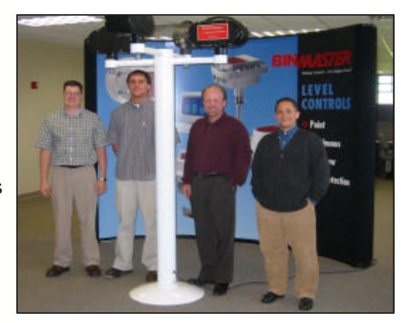
Sales and Application Specialist