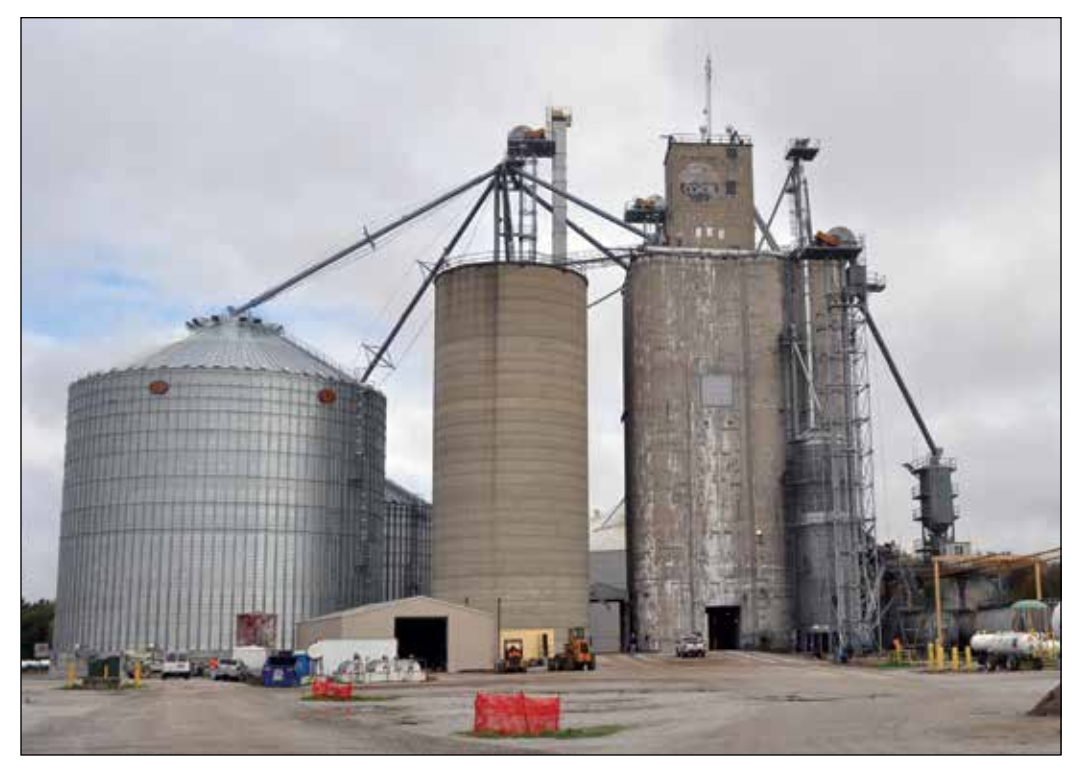
Co-Alliance, LLP's 3.1-million-bushel grain elevator at Union Mills, IN, a little over a year after an explosion damaged portions of the concrete workhouse and adjacent grain dryer. The 700,000-bushel GSI steel tank at left is new.

Aeration fans......The GSI Group Bearing sensors..4B Components Ltd. Bin erector.... Hershberger Bin Jackers Bin sweep......The GSI Group Bucket elevators.....The GSI Group Contractor ..... Carroll Construction Conveyors ......The GSI Group Distributor.....Schlagel Inc. Electrical contractor......MP Baker Elevator buckets ..... Maxi-Lift Inc. Grain dryer ...... Zimmerman Grain Grain temp. system.. Rolfes@Boone Level indicators..... BinMaster Level Manlift.....Sidney Mfg. Co. Millwright.. Carroll Construction Co. Motion sensors .. 4B Components Ltd. Motors ......Baldor Motors Steel storage......The GSI Group