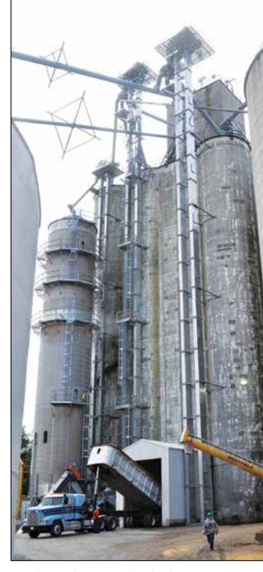
Producer deposits a load of grain into a new receiving pit, which feeds a new 25,000-bph GSI outside leg at right.