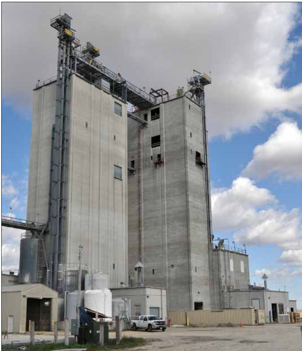
Twin towers – Lincoln Supply LLC’s 800,000-tpy milling complex right off Interstate 35 near Ellsworth, IA. Both towers were built by Younglove Construction LLC.

When Lincoln Supply LLC built a 400,000-tpy feed mill in 2008 just off the Interstate 35 exit at Ellsworth, IA, the idea was to serve the rapidly growing turkey industry in central Iowa.