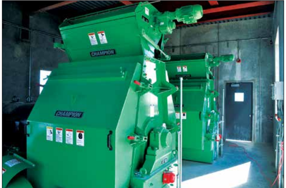
Pair of CPM Roskamp Champion hammermills for grinding incoming corn in the new tower.

Lincoln Supply included the new tower on the same WEM automation system as the original tower. In the new tower, controls cover a new 12-ton Hayes & Stolz double-ribbon mixer. Pittman anticipates that upon startup, mixing time for a single