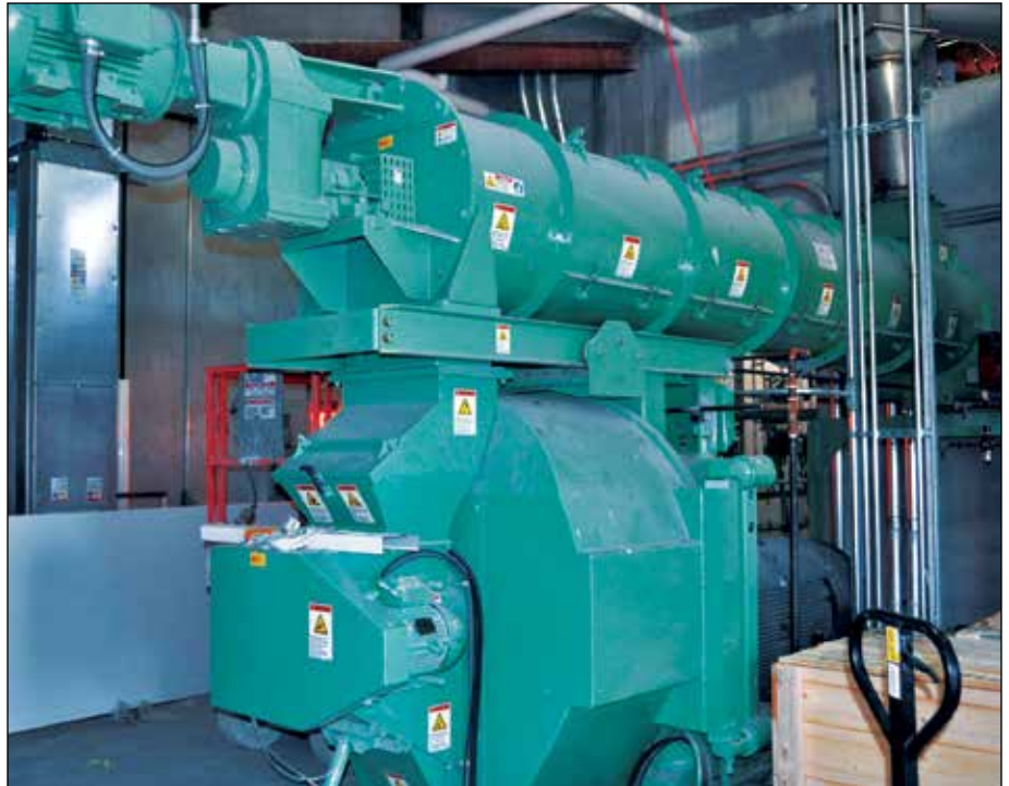
One of two CPM Model 7936-14 pellet mills capable of producing 50 tph.

batch will be 3-1/2 to four minutes. A 24-bin CPM Beta Raven microingredient system feeds into the mixer.