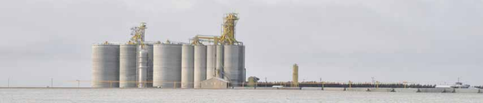
Long-distance view of the 10-million-bushel-plus rail terminal at the edge of Colby.