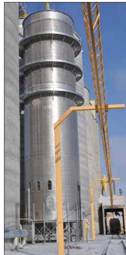
New 6,000-bph Zimmerman tower dryer is the first at the Colby terminal.