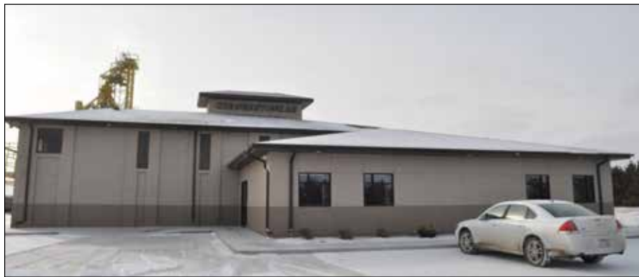
Newly expanded office building includes another 3,500 square feet of space.

With the emphasis on moving fall crop handling out to the rail terminal, the new tanks now have their own receiving system. That includes a new 1,000-bushel mechanical receiving pit feeding a 30,000-bph InterSystems receiving leg. The leg is outfitted with two rows of Maxi-Lift 18x8 Tiger-Tuff buckets mounted on a 40-inch belt on 9-1/2-inch centers. A 20,000-bph Ferrell-Ross drag scalper installed adjacent to the pit allows for grain cleaning, before the grain can go anywhere else.